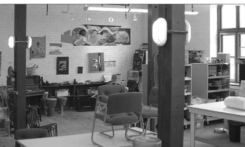
View of the studio

Mentoring program participants will be paired with artists in the community to explore their field and make lasting links to the broader Toronto arts community. Sketch is so excited about providing the opportunity for participants to learn with and from practicing