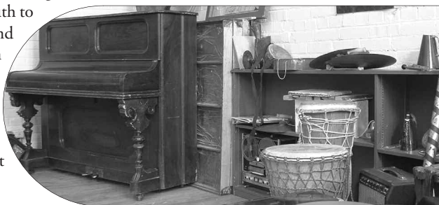
View of the music area