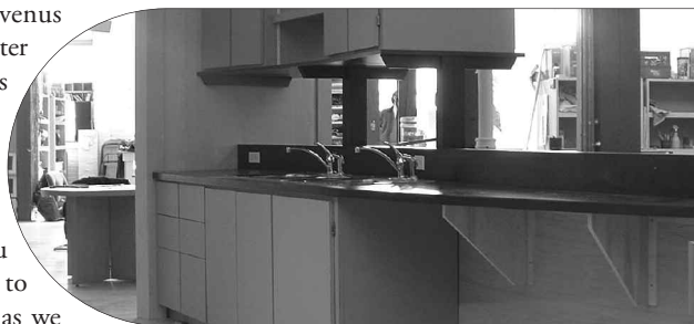
View of the kitchen area